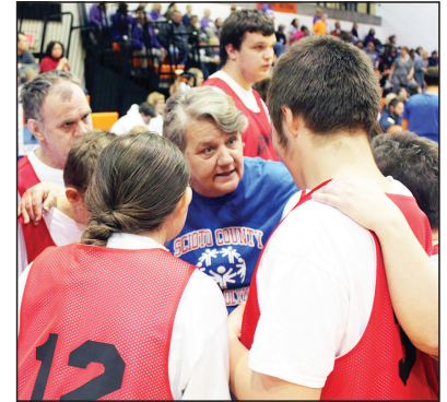
Photos from the Rivals Game