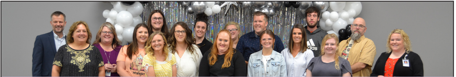
One Year Recipients