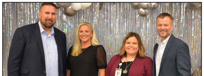
15 Year Recipients