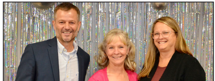
30 Year Recipients