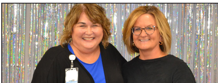
25 Year Recipients