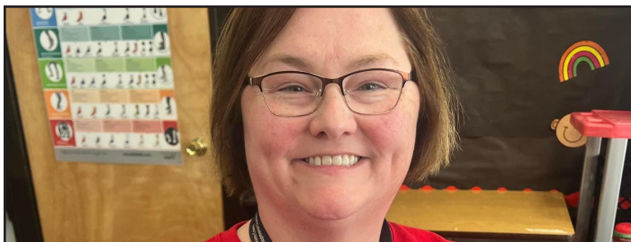
20 Year Recipient