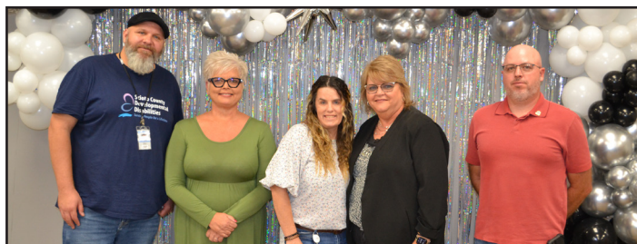
10 Year Recipients