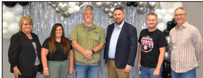
Three Year Recipients