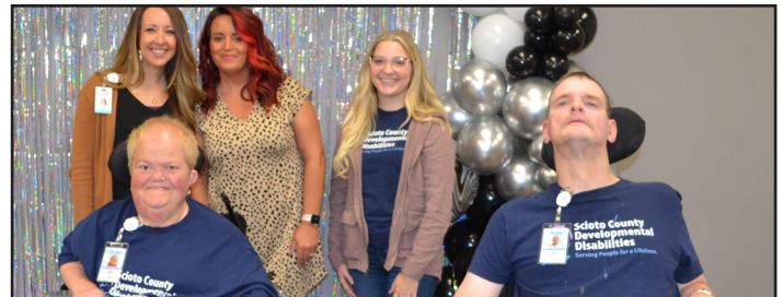
Five Year Recipients